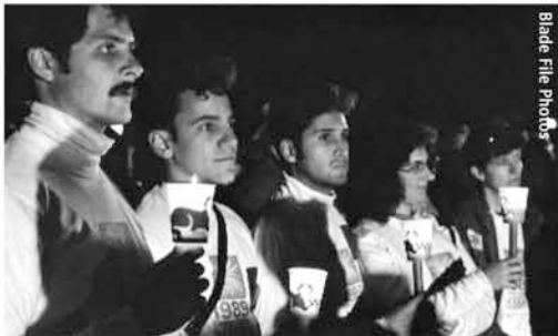
Blade File Photos